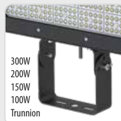
300W 200W 150W 100W Trunion