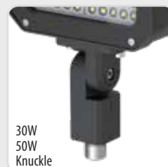
30W 50W Knuckle