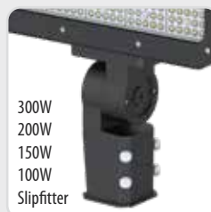
300W 200W 150W 100W Slipfitter