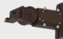
Universal Pole Mount DBXF-UNI-G2